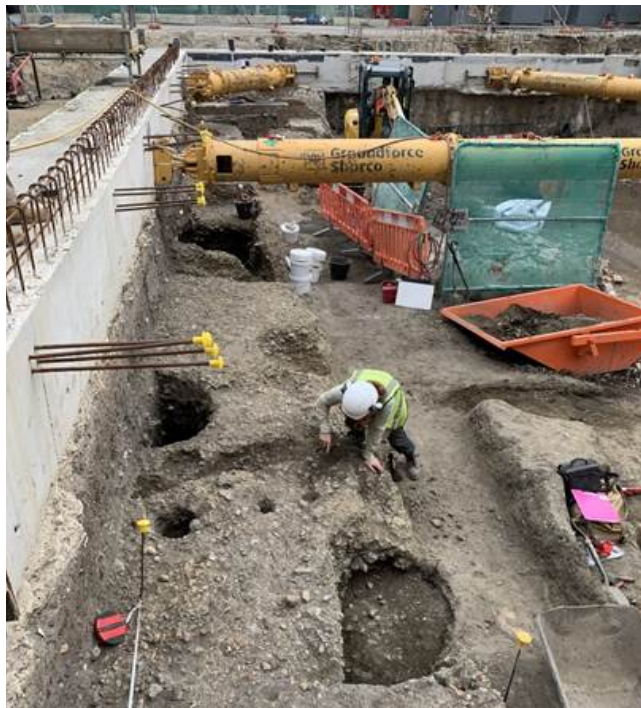
Mint Yard: Excavating features cutting the Roman street looking east. The beam slot and post-holes form part of an Early Anglo-Saxon building.